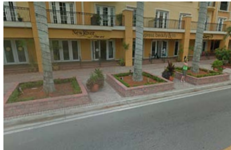
Planter wall at 5 th Ave S & 6 th St S and on both Gordon River Bridges (both walls are same style): Hourly Rate for planter wall repair: $_____ /hr