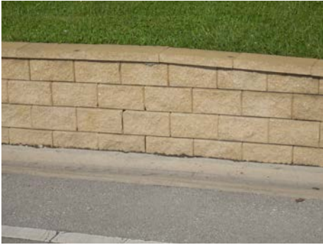
Hourly Rate for retaining wall repair: $_____ /hr Retaining wall at Crayton Road & Whispering Pine Lane

The prices below shall include equipment, tools, labor and all setting materials necessary to complete damaged wall or planter. Wall materials supplied by City of Naples, property owner or per material price list below.